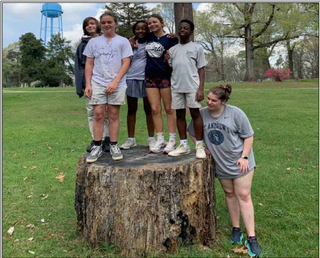
Volunteers enjoyed the activities of the day—cleaning headstones, petting Sally Mae & scavenger hunt