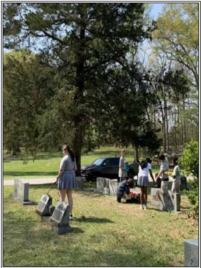
Springtime Beauty — St. Alban's idyllic & parklike grounds