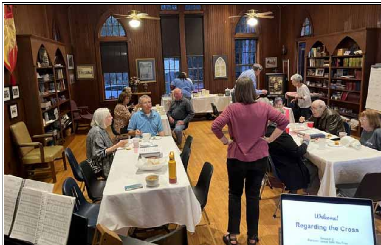
Crowd gathers for soup in the Parish Hall followed by the Lenten series presentation—'Regarding the Cross'